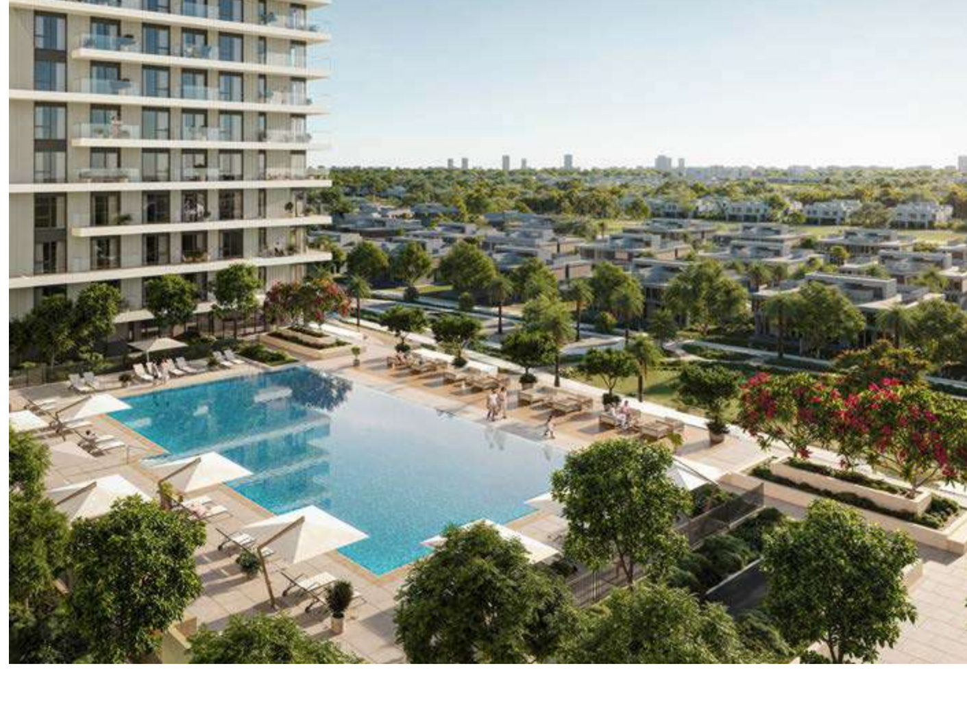
World-class amenity podium