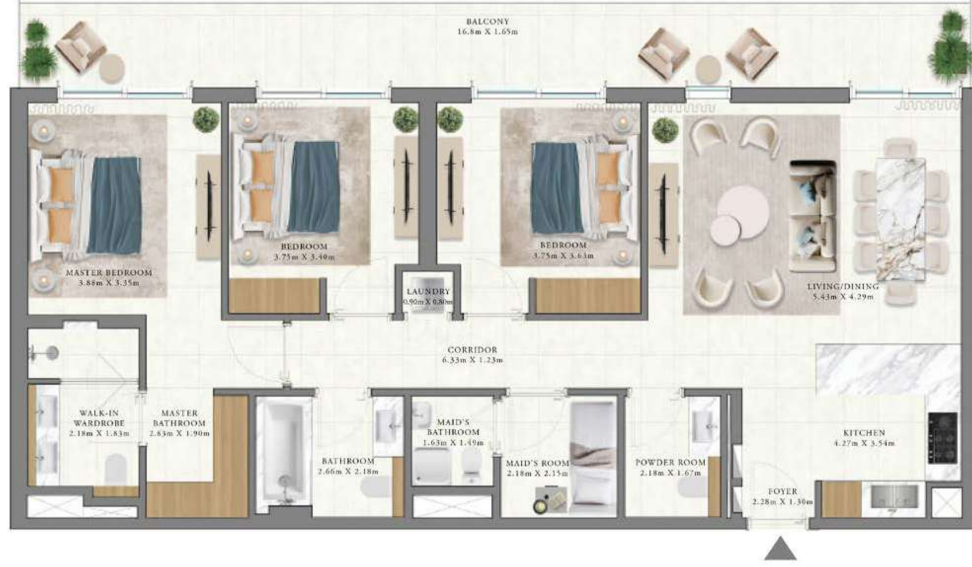
3 Bedroom / Type 2F