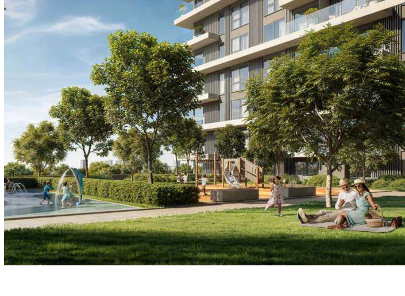
Kids' play area