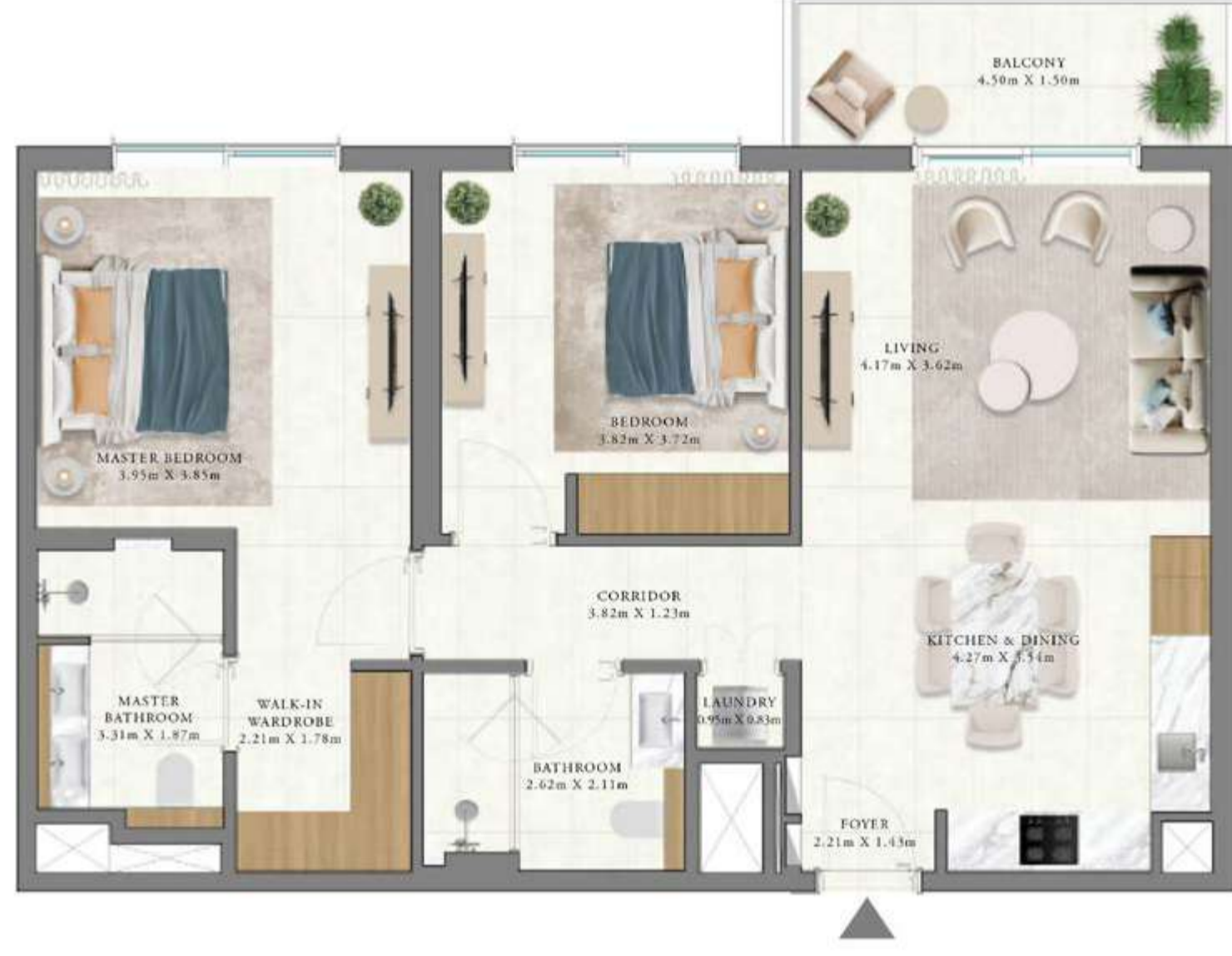
2 Bedroom / Type 3A