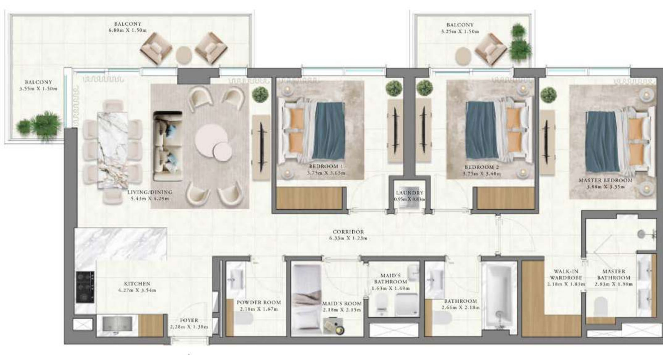
3 Bedroom / Type 2A