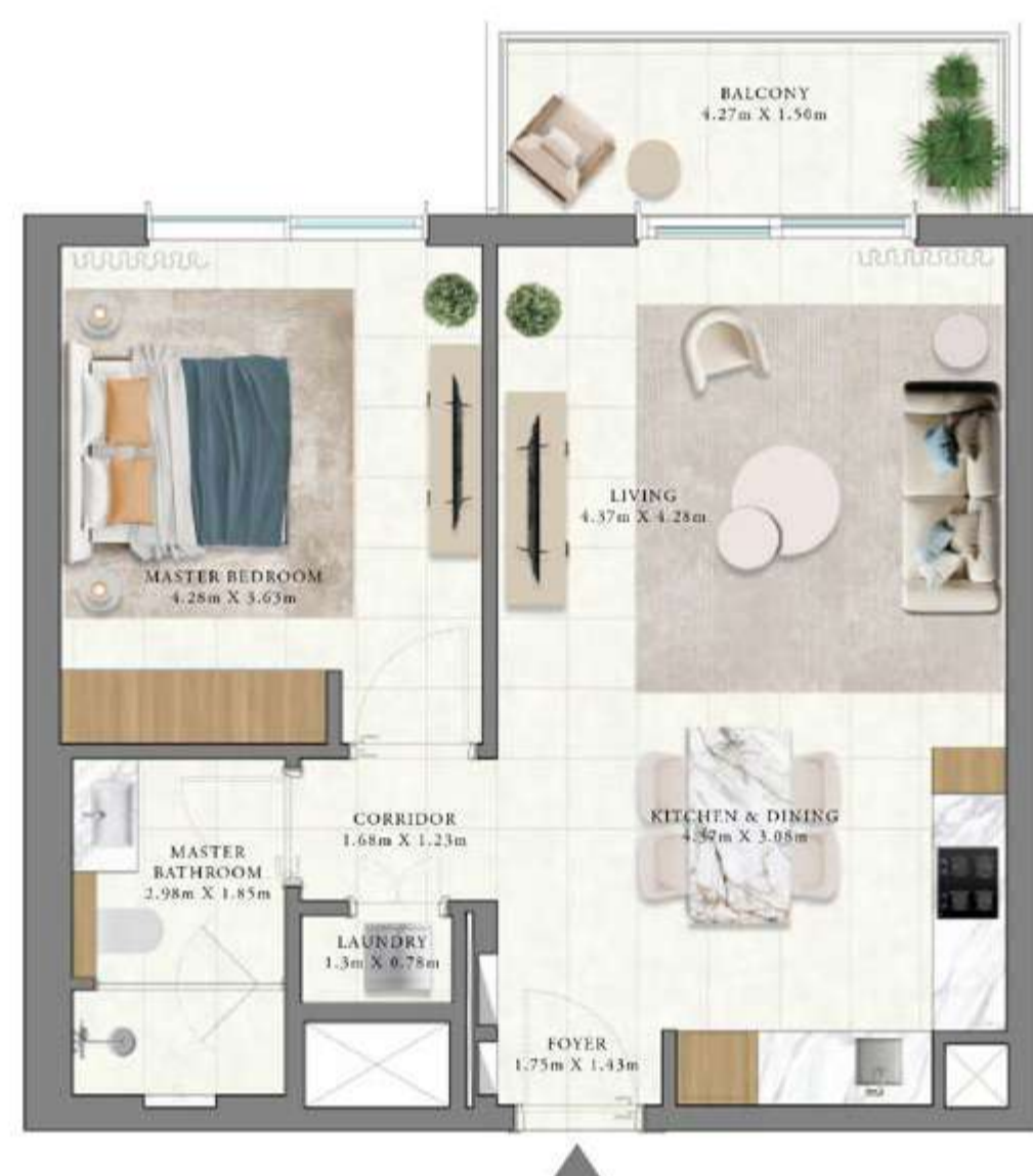
1 Bedroom / Type 1B