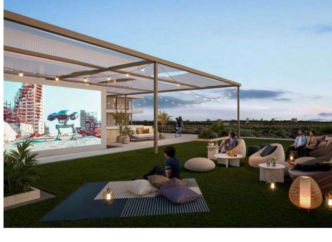
Outdoor rooftop cinema